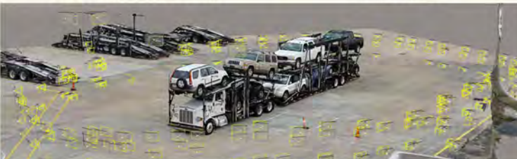
PHOTGRAMMETRY STRUCTURE TO PROCESS VEHICLE INTO 3D IMAGERY