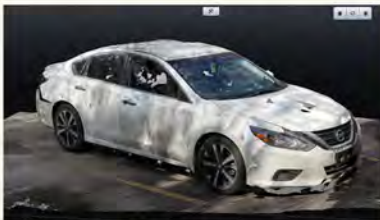
CONTEXT CAPTURE 3D MODEL IMAGERY

WE EMPLOY PROVEN INVESTIGATION TECHNIQUES AND A FINELY TUNED ATTENTION TO DETAIL, WHILE USING THE LATEST TECHNOLOGY AVAILABLE IN FORENSIC AND DEMONSTRATIVE SOFTWARE. ATA COMBINES ITS RESOURCES TO PROVIDE FULL TOP-TO-BOTTOM FORENSIC SERVICES TO OUR CLIENTS, WHICH RESULTS IN A HIGHLY EFFICIENT PROJECT MANAGEMENT MODEL WITH EXCELLENT COST-VALUE.