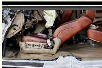
CONTEXT CAPTURE 3D MODEL IMAGERY