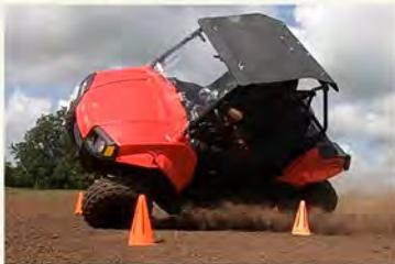
UTV ROLLOVER TESTING WITH PROFESSIONAL STUNT DRIVER