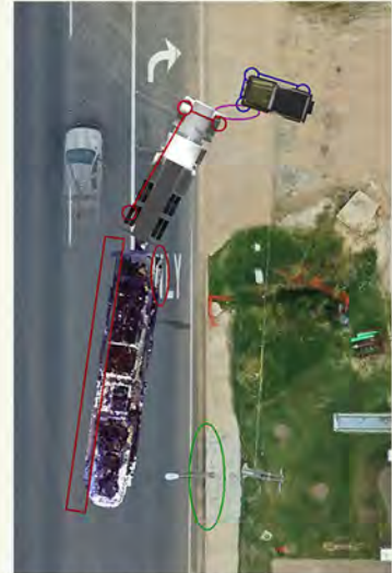
FORENSIC APPLIED GRAPHICS ANALYSIS OF INCIDENT SITE