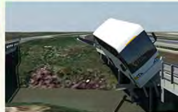
3D ANIMATION IMAGE