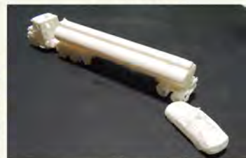
3D PRINTER MODEL

THE EXPANDED DIGITAL AND FACILITY RESOURCES AVAILABLE TO OUR STAFF ALLOW ATA'S EXPERTS TO CONSISTENTLY GENERATE CREATIVE AND INNOVATIVE WAYS TO PROVIDE EFFECTIVE LITIGATION AND ANALYSIS SUPPORT.