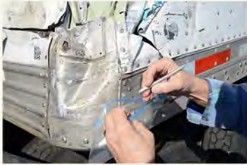
COLLECTION OF PAINT SAMPLES FROM A TRACTOR TRAILER