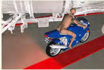
IMAGE FROM A FARO ZONE 3D ANIMATION